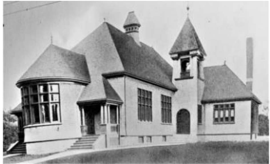
Smith Memorial Hall, as depicted in Dighton Bi-Centennial Celebration . Taunton, Mass.: C.A. Hack & Son. 1912. Note: