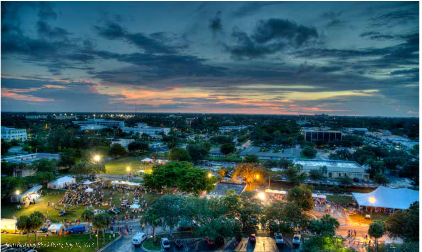
50th Birthday Block Party, July 10, 2013

The City of Coral Springs has come a long way since its humble beginnings 50 years ago. Looking back on the past year, it has been full of exciting events highlighting the City's history. For the City's golden anniversary, the community came together and celebrated the place we all love to call home.