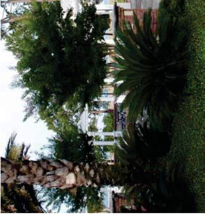
RIVERFRONT PARK: TABB Y W