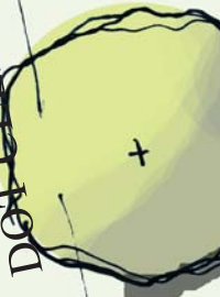
DOT CLEAR ZONE (TYP.)