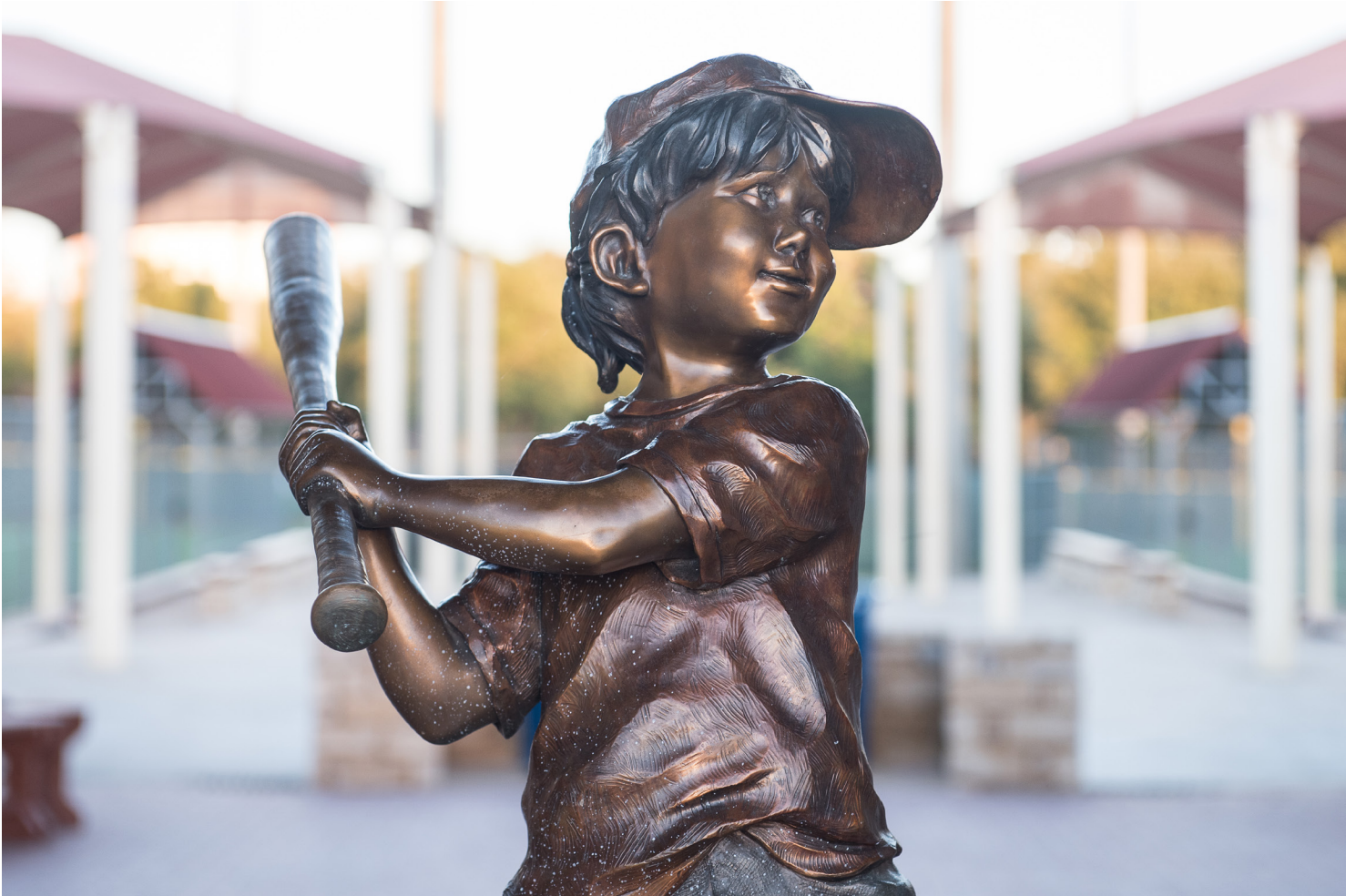
Walt Horton, Out of the Park , 1999, Allen Station Park