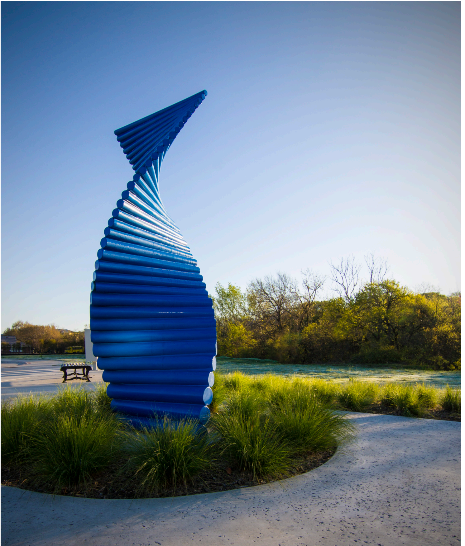
Todd Griggs, Wave Machine , 2015, Cotton Crossing Trailhead