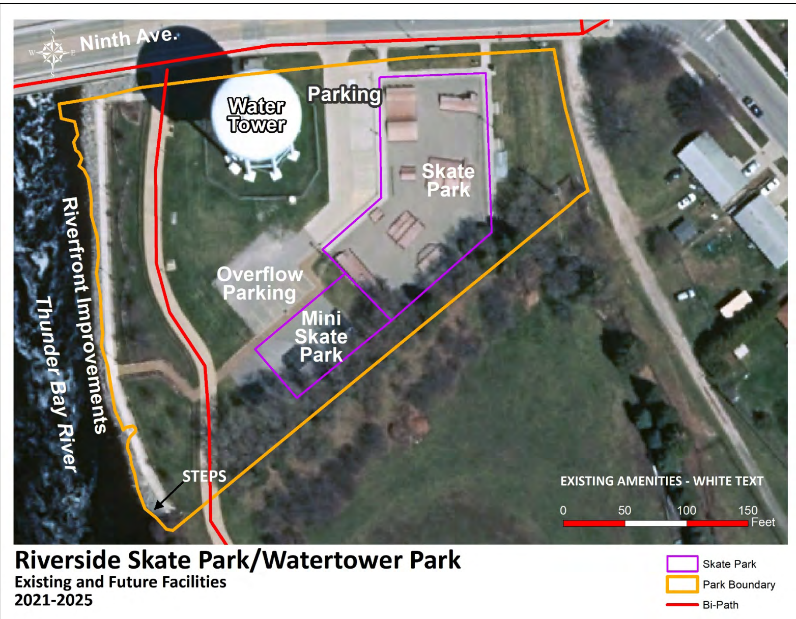
MAP 21: RIVERSIDE SKATE PARK/WATERTOWER PARK