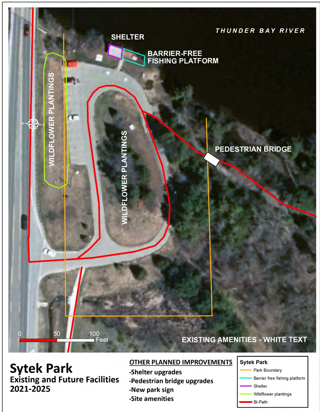
MAP 8: ARTHUR SYTEK PARK