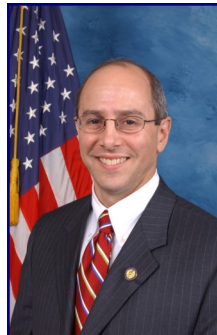
Rep. Boustany (R-LA)

“The Boustany amendment ensures revenue coming into the HMTF is used and spent for its designated purposes—harbor maintenance and dredging,” Boustany said. “According to the Army Corps of Engineers, America’s arteries of commerce and job creation are blocked—almost 30% of our nation’s ports are hindered because of inadequate channel depths attributed to a lack of proper dredging. The amendment guarantees the total amount available for spending from the HMTF each fiscal year is equal to the HMTF receipts.”