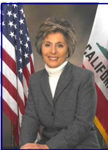
Sen. Boxer (D-CA)

Immediately upon House passage, H.R. 4348 was referred to the Senate for its consideration. On April 24, the Senate passed / agreed to H.R. 4348, but the Senate’s version of the legislation included an amendment offered by Sen. Barbara Boxer (D-CA). While the Boxer amendment was not directly related to the HMTF provisions, it will have to be reconciled by the House. APA will continue to monitor and report on the progress of this important legislation.