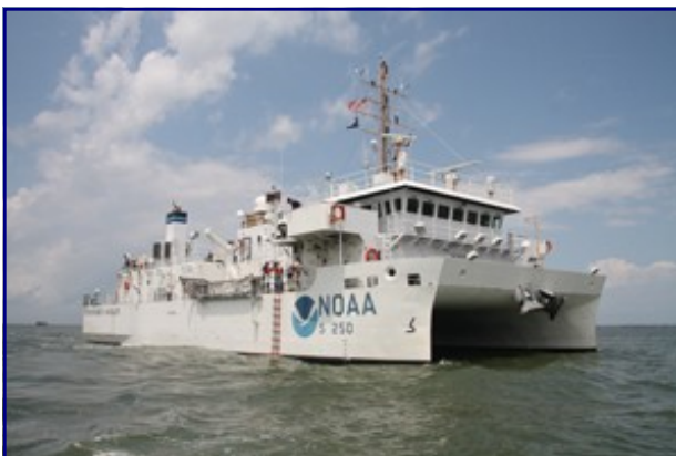
(Above) NOAA'S newest coastal mapping vessel, the FERDINAND R. HASSLER.

The 124-foot ship will operate along the Atlantic and Gulf coasts, as well as in the Great Lakes in support of NOAA's Office of Coast Survey. The new ship's primary mission will be to detect and monitor changes to the sea floor. Data collected by the ship will be used to update nautical charts, detect potential hazards to navigation, and enhance the overall understanding of the ever-changing marine environment.