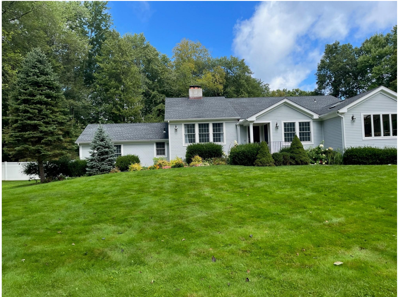
Front facing Davenport Ridge