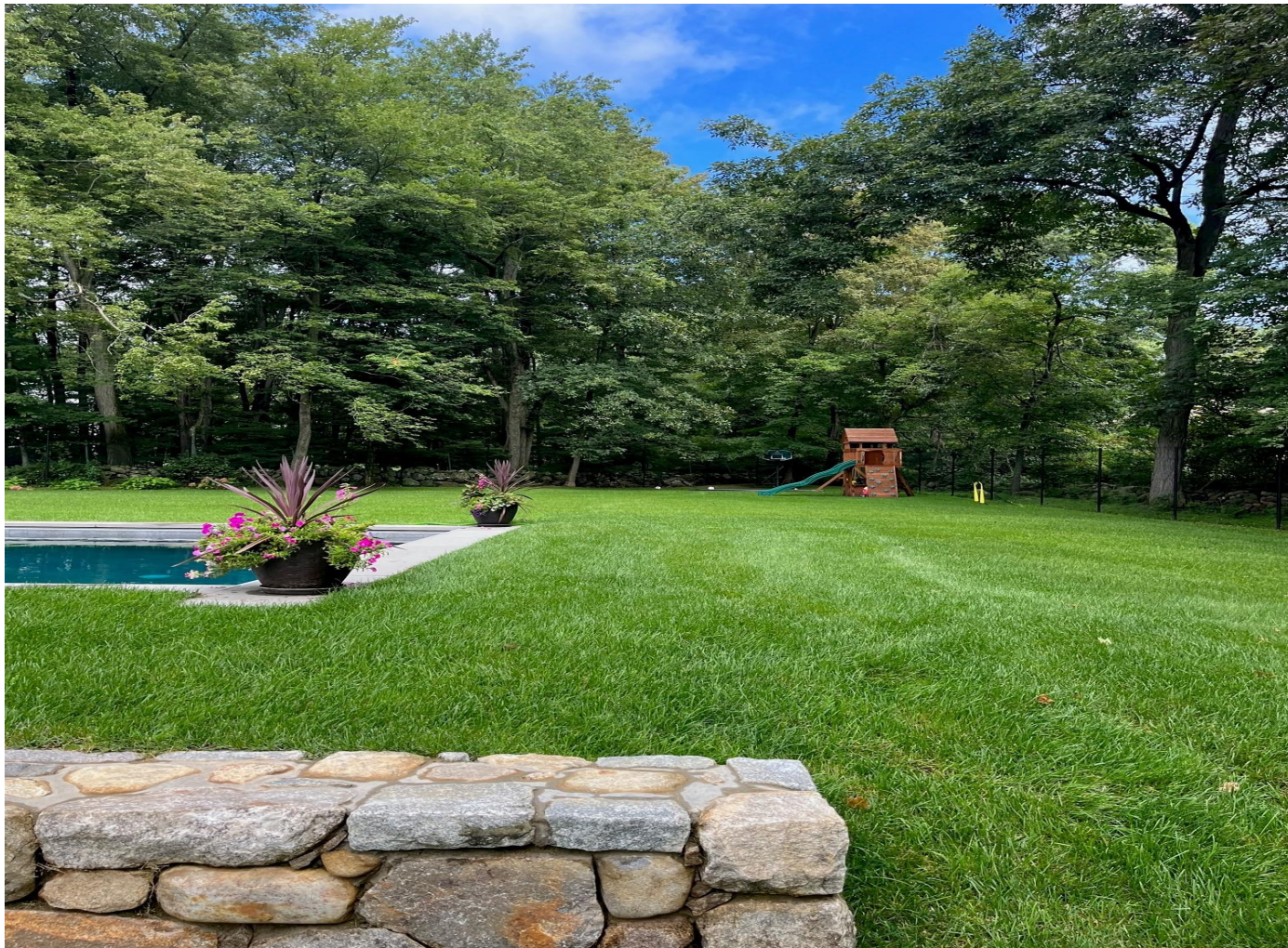
North View of rear yard