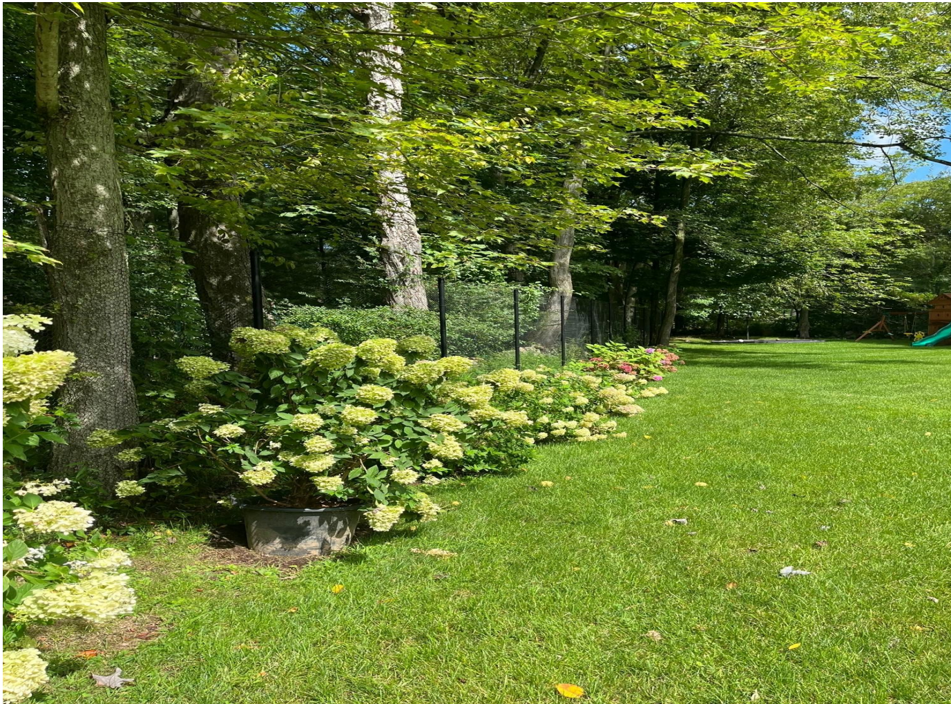
West property line screening looking North