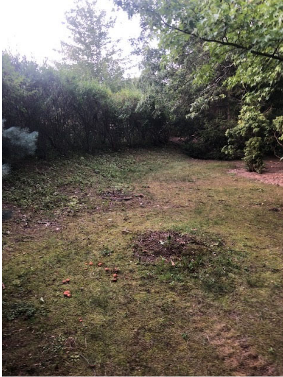
These photos show the remains of some of the spruce trees that were along the forsythias. The last director left the stumps, the new director recently removed them.