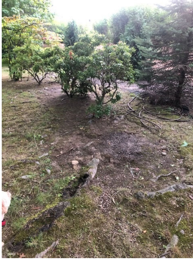
Missing at least one, maybe two shrubs.