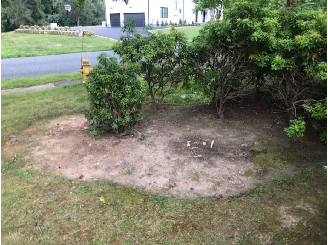
Three dead plants were recently replaced with one shrub.