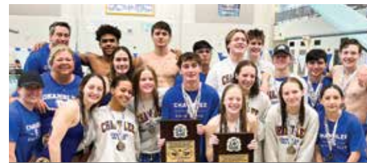
2024 DeKalb County Diving Championship Medalists