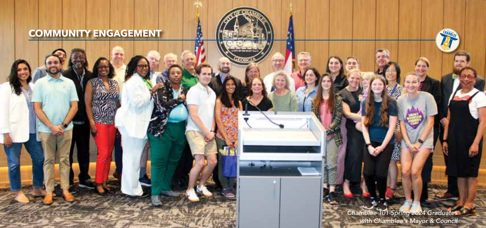
Chamblee 101-Spring 2024 Graduates with Chamblee's Mayor & Council