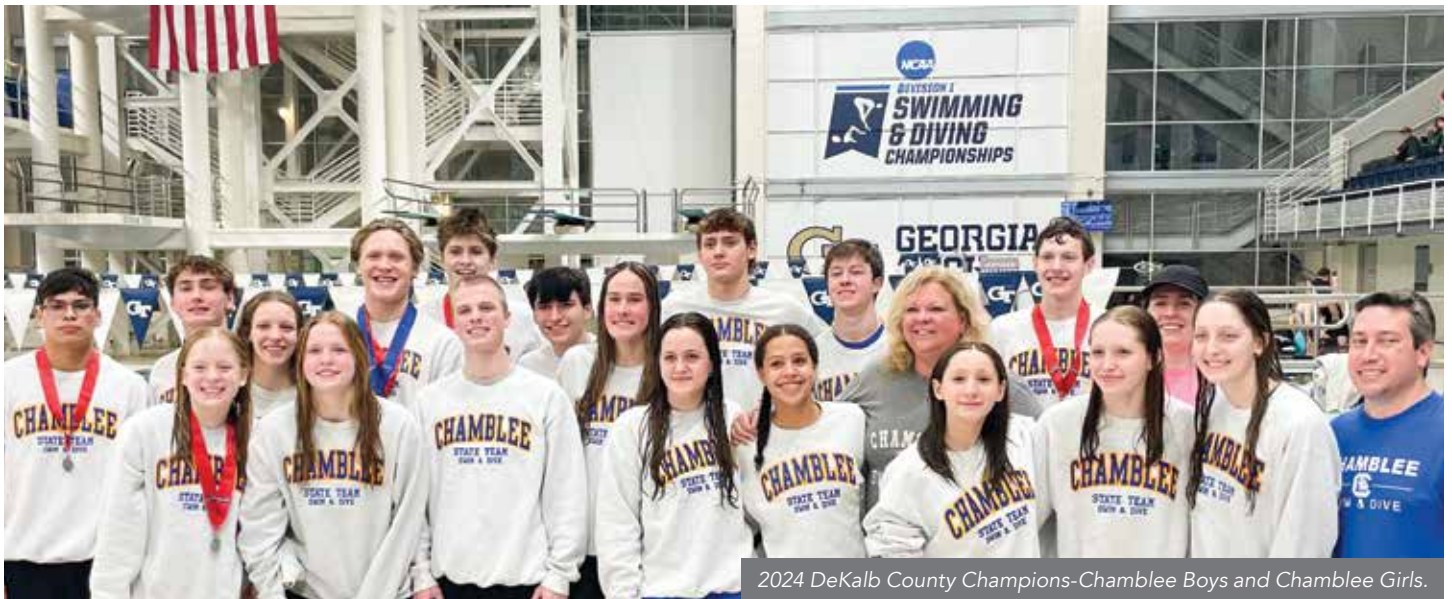
2024 DeKalb County Champions-Chamblee Boys and Chamblee Girls.