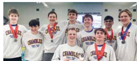
2024 DeKalb County Boys Team Champions