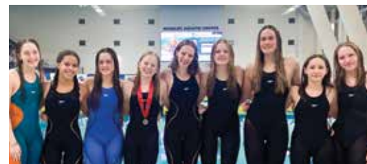
2024 DeKalb County Girls Team Champions