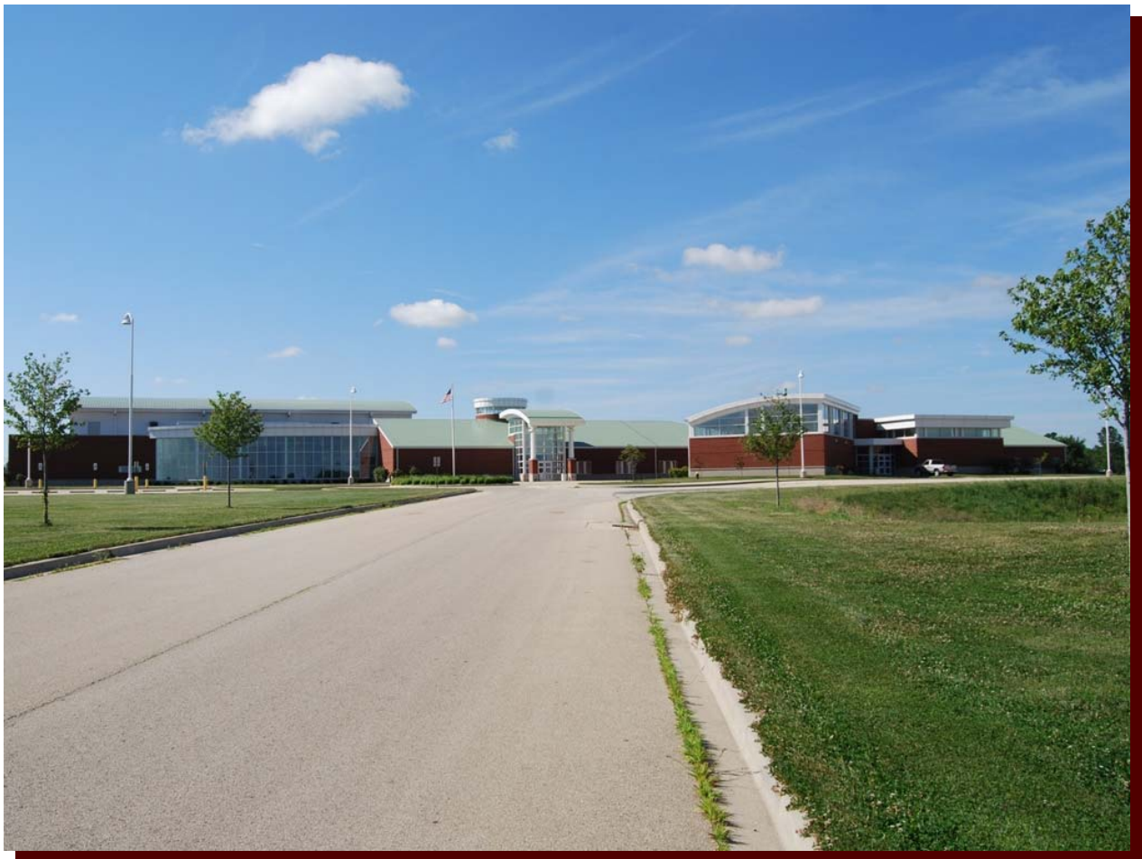
Monticello Middle School

There are currently 26 public schools within seven different school districts that serve the residents of Piatt County. Table 4-1 shows there are 12 elementary level schools, six middle schools, and seven high schools. Enrollment varies from 27 students at Deland-Weldon Middle School to 862 students at Mahomet-Seymour High School.