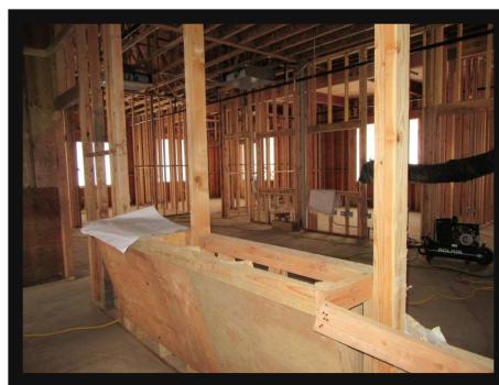
City Hall reception area