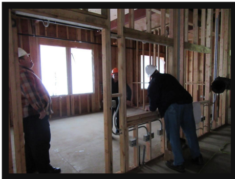
Future City Hall office space