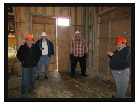
Main public lobby