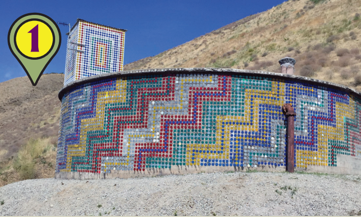
Water Tower Art (reflector) Mural by Richard C. Elliot (1992) Re-installation (2016) A must see at night You can light it up with a flash light