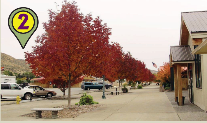
Pateros Mall - "Our Main Street" Designed by Mid-Century Architect Don Hollingsberry Pedestrian access to post office & library, retail, and restaurant businesses