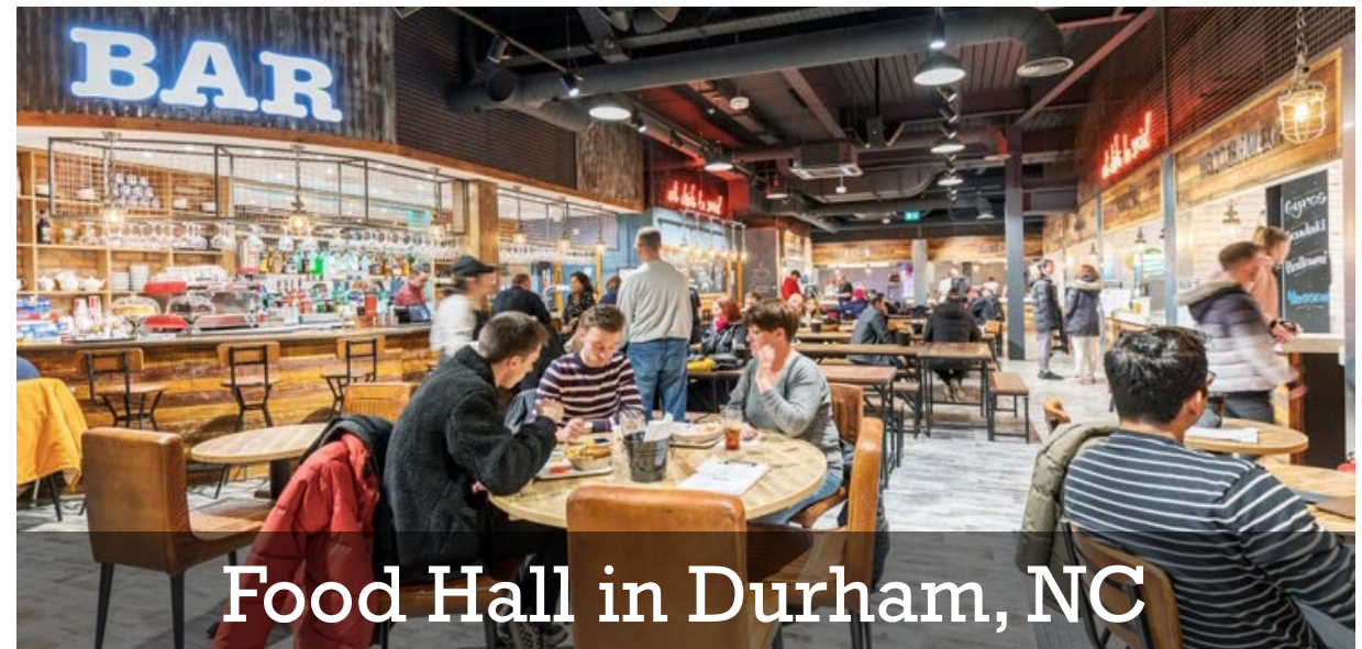
Food Hall in Durham, NC