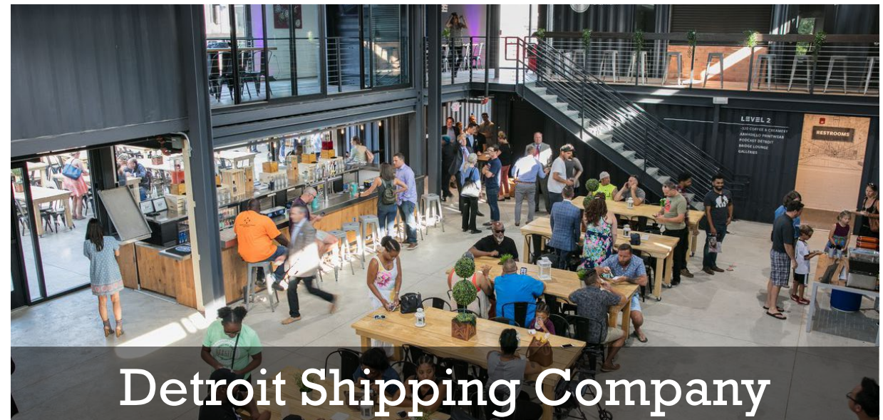
Detroit Shipping Company