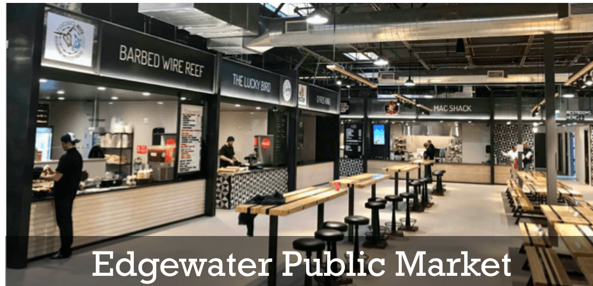
Edgewater Public Market