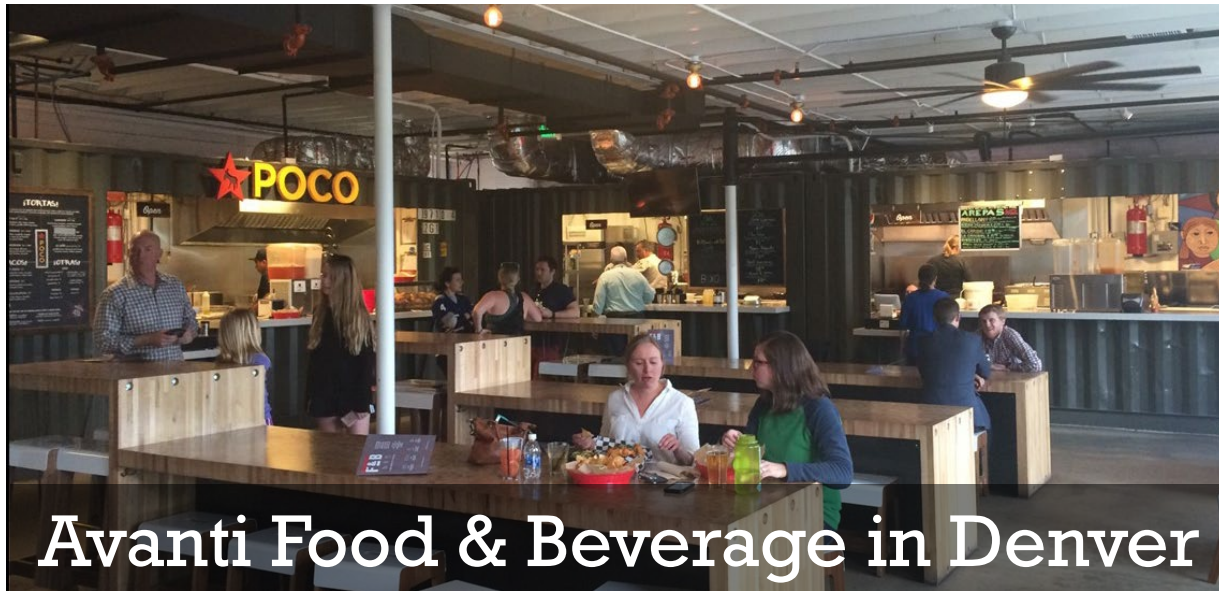
Avanti Food & Beverage in Denver