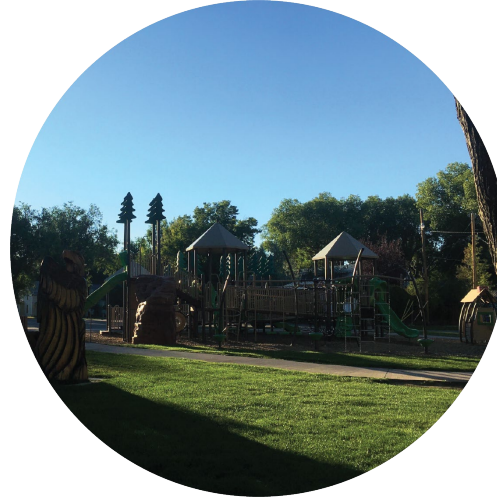
Breeze Park Improvements