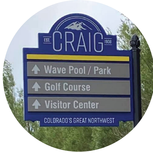
Implemented Wayfinding Signage