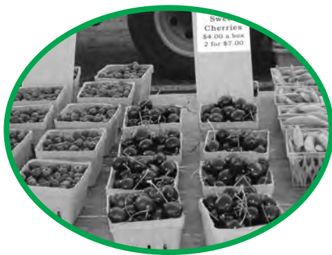
Enjoy the bounty of summer at Elmhurst's Farmer's Market, Wednesdays, 7 a.m. - 1 p.m.