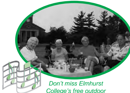
Don't miss Elmhurst College's free outdoor concerts on the lawn.