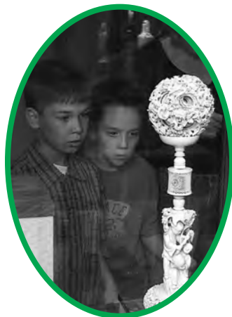
There's something to amaze everyone at the Lizzadro Museum of Lapidary Art