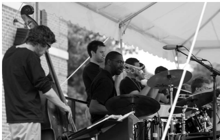
Elmhurst College's Summer Extravaganza will take place on June 16

Lizzadro Museum of Lapidary Art 2 p.m. 45 minutes. Ages 5 to adult