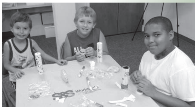
Stop by the Education Center at EHM on Tuesdays for Summer Fun & Games

Looking for some crafty fun for the kids on summer afternoons? The Elmhurst Historical Museum will offer Tuesday afternoon drop-in craft programs from June 19 through August 14 for children ages 4 through 12. Each week, kids will make a different craft from 1 until 3 p.m. The cost is only $1 for members, $2 for non-members. Children must be accompanied by a caregiver. For a complete listing of programs, go to www.elmhursthistory.org in the Programs & Events section (under the Family Programs tab), or look in the Front Porch city calendar in this newsletter.