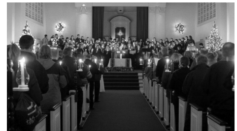
The Annual Festival of Lessons and Carols will take place on Friday, December 6, 4 and 7 p.m., Elmhurst College Hammerschmidt Chapel.

Wagner Community Center 615 North West Avenue 7-9 p.m. $12 resident/$15 non-resident