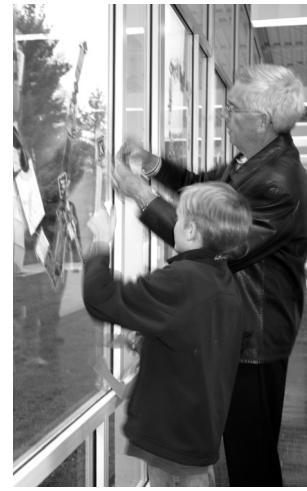
Grandfather and grandson playing with Activity.