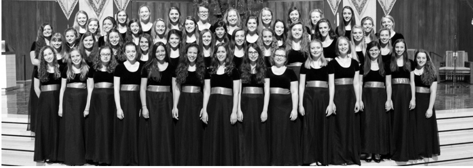
The Spirit Singers