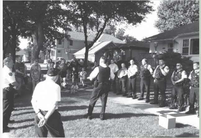
The Elmhurst Neighborhood Roll Call program offers residents the opportunity to meet their local officers in an informal, non-enforcement setting.

If you have any questions, or would like to request a roll call in your neighborhood, please call (630) 530-3061.