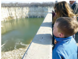
The Elmhurst-Chicago Stone Co. quarry was one of Elmhurst's oldest businesses and has been a DuPage County Flood Control Facility since 1993.

The Elmhurst Quarry Flood Control Facility is a familiar site to Elmhurst residents, yet few have ventured inside since it is generally closed to the public. If you've ever wondered what goes on at the quarry and how it functions, then be sure to sign up to take a behind-the-scenes tour on Saturday, Sept. 30. Tour participants will have a rare opportunity to explore the quarry, learn about its history, visit various areas including private quarry platforms, and see how the facility operates. The tours are co-presented by DuPage County Stormwater Management and Elmhurst History Museum. Tours will be led by DuPage County staff and depart from Elmhurst History Museum via bus every 30 minutes from 9 a.m.-2:30 p.m. and last approx. two hours. Registration is required and may be made online at elmhursthistory.org (Special Events section), and the cost is $10 each. Ticket sales begin on Sept. 6 at 9 a.m. Children 10+ are allowed but must be accompanied by an adult. For more information, visit elmhursthistory.org or call the museum at 630-833-1457.