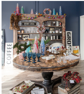
NEW! Bread & Butter (131 W First St)