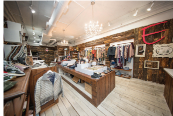
E Lounge (104 W Second St)

Sales tax revenue accounts for a municipality's largest source of budget revenue. Purchasing local keeps your dollars local.