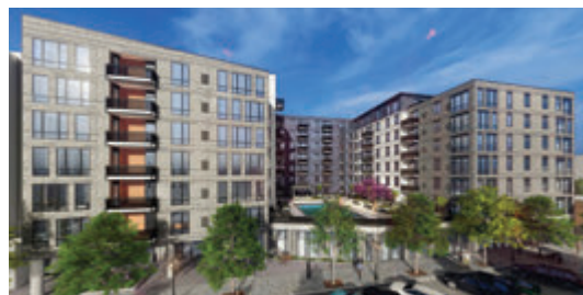
(Rendering of Lennar development at 183 N. Addison)

The value of commercial construction permits in Elmhurst has exceeded $180 million in 2019 thanks to ongoing re-investment from local companies; for instance McMaster-Carr (600 N. County Line), X-pert Trade Show Carpeting (845 N. Larch), and Honda on Grand (300 W. Grand) each of which is currently undergoing an expansion or renovation project. Additionally, investment continues in the form of Transit Oriented Developments (TOD) in the City Centre, as both the Condos at the Hill (105 S. Cottage Hill), and ONE95 Condos (195 N. Addison) begin to take shape. These new condos join TODs Elmhurst 255 (255 N. Addison opened in fall 2017) and The Marke (100 N. Addison which opened in May of 2019) and is over 50% leased in less than 4-months. TODs create vibrant, livable communities in the heart of downtown – the newest TOD project by the Lennar Group is set to break ground this fall at 183 N. Addison and will feature 212 luxury apartments.