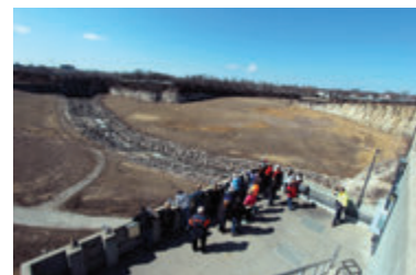
The Elmhurst-Chicago Stone Co. quarry was one of Elmhurst's oldest businesses and has been a DuPage County Flood Control Facility since 1993.

The Elmhurst Quarry Flood Control Facility is a familiar and intriguing site for locals, but it is rare that residents can get a close-up look at the storied site since it is generally closed to the public. If you've ever wondered what goes on at the quarry and how it functions, that opportunity is coming on Saturday, September 21 . Behind-the-scenes guided tours of what was once known as the Elmhurst-Chicago Stone Co. quarry—one of Elmhurst's earliest businesses—will take place throughout the day. Visitors will explore various areas of the quarry, including private viewing platforms, to learn about its history and see how it operates today as a flood control facility. The tours are co-presented by DuPage County Stormwater Management and the Elmhurst History Museum. Tours will be led by DuPage County staff and depart from the Elmhurst History Museum via bus every 30 minutes from 9:30 a.m.-1:30 p.m. and last approximately two hours. Online registration is required and may be made online only at elmhursthistory.org in the Special Events section. The cost is $12 each. Ticket sales begin ONLINE ONLY at elmhursthistory.org (in the Special Events section) starting on September 3 at 9:00 a.m. until sold out. Children must be age 10+ (no exceptions) and accompanied by an adult. For more information, visit www.elmhursthistory.org or call 630-833-1457.