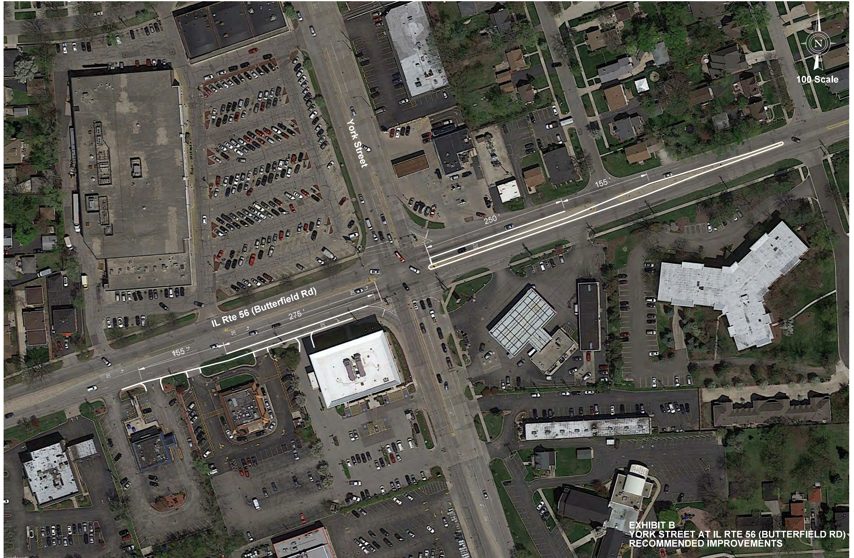
EXHIBIT B YORK STREET AT IL RTE 56 (BUTTERFIELD RD) RECOMMENDED IMPROVEMENTS