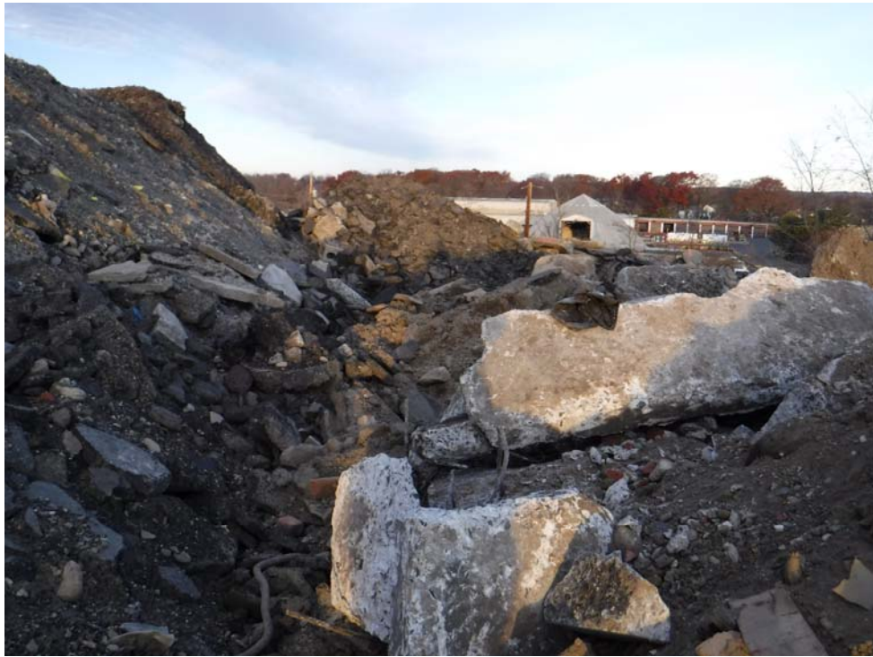
Northeastern side of the main pile containing large pieces of concrete.