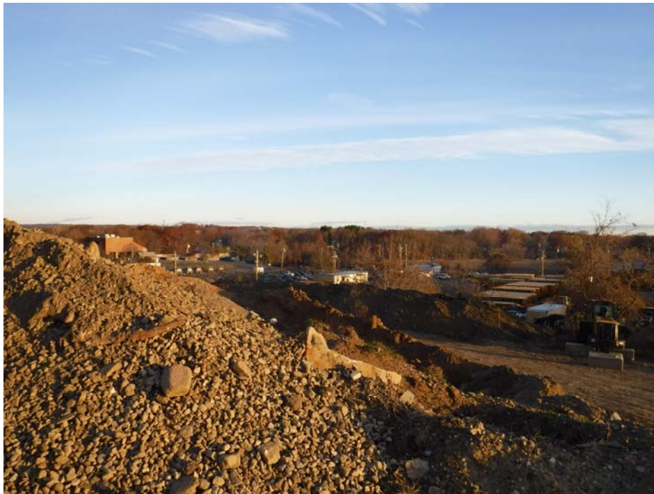
Eastern side of the main pile containing large amounts of course gravel and cobbles.