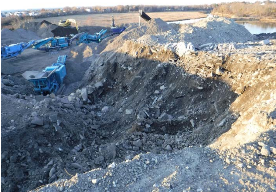
Photograph of activity along the southern side of the main pile. Julian is continuing to make progress removing material for processing and offsite use.