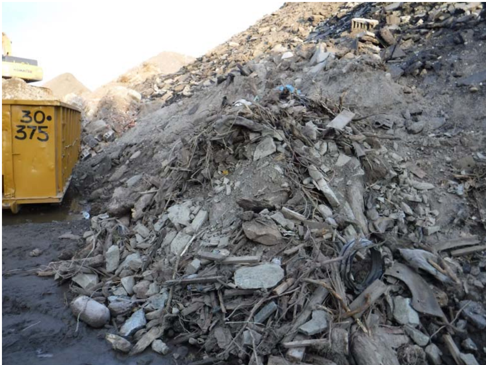
Southeastern face of the main pile with piles of debris and organic material.