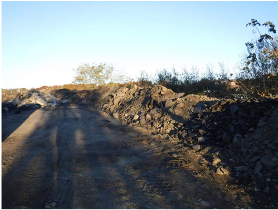
Asphalt piles along the northeastern portion of the property.