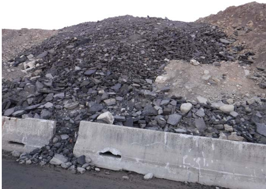
Piles of asphalt long the southwestern face of the main pile.