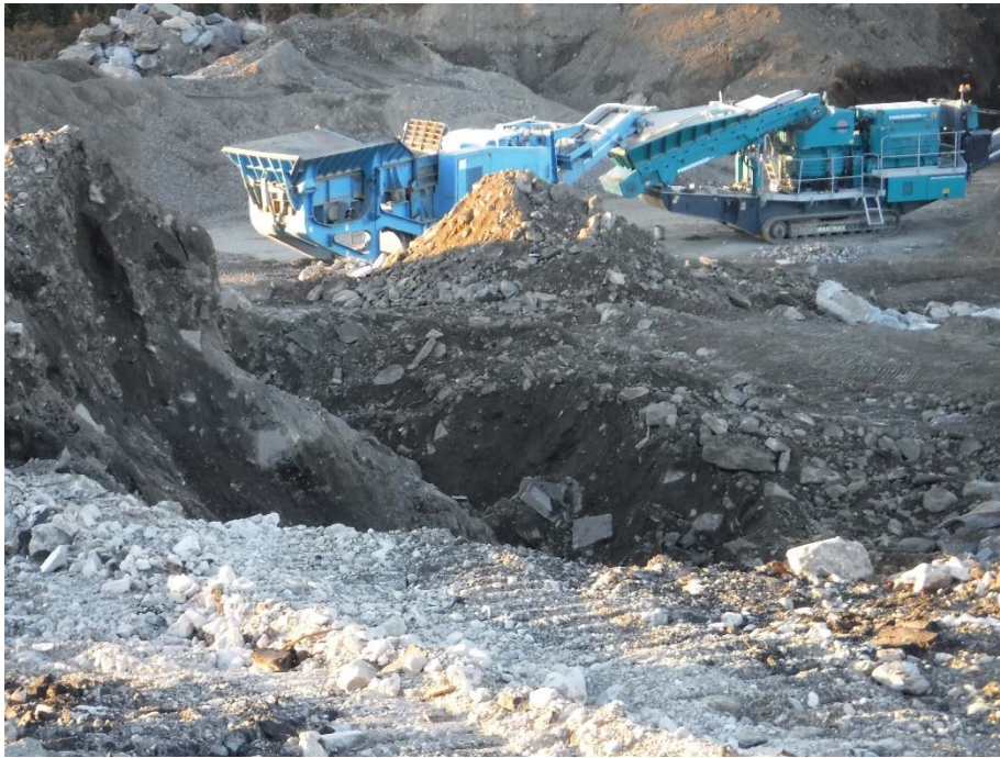
Southern face of the main pile with additional material removed.