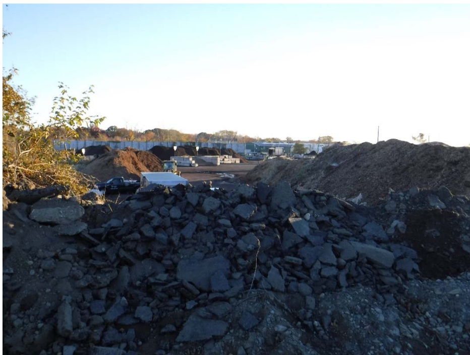
Asphalt pile along the northern side of the main pile.