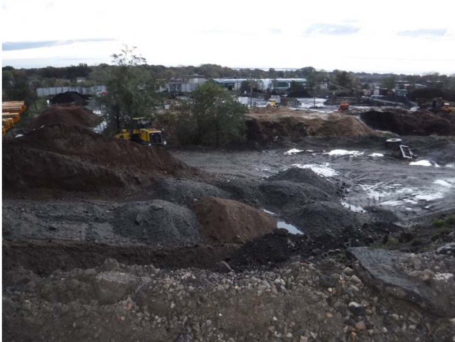
Eastern side of main pile, looking down from top of the pile, facing east. Soil has been re-worked/moved to assist in filling in/drying out large puddles due to rain. The brown soil consists of material represented by the S-5 sample collected October 14, 2016 and the gray soil consists of material represented by the S-1 sample collected September 29, 2016.