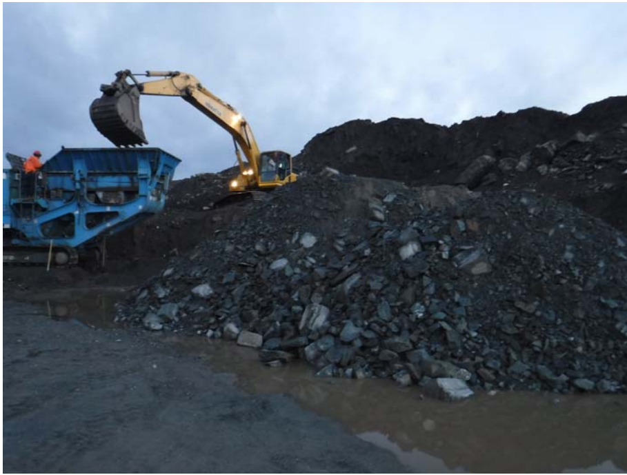
Screening new material along southern edge of main pile. Photograph taken from southern side of main pile facing northwest.