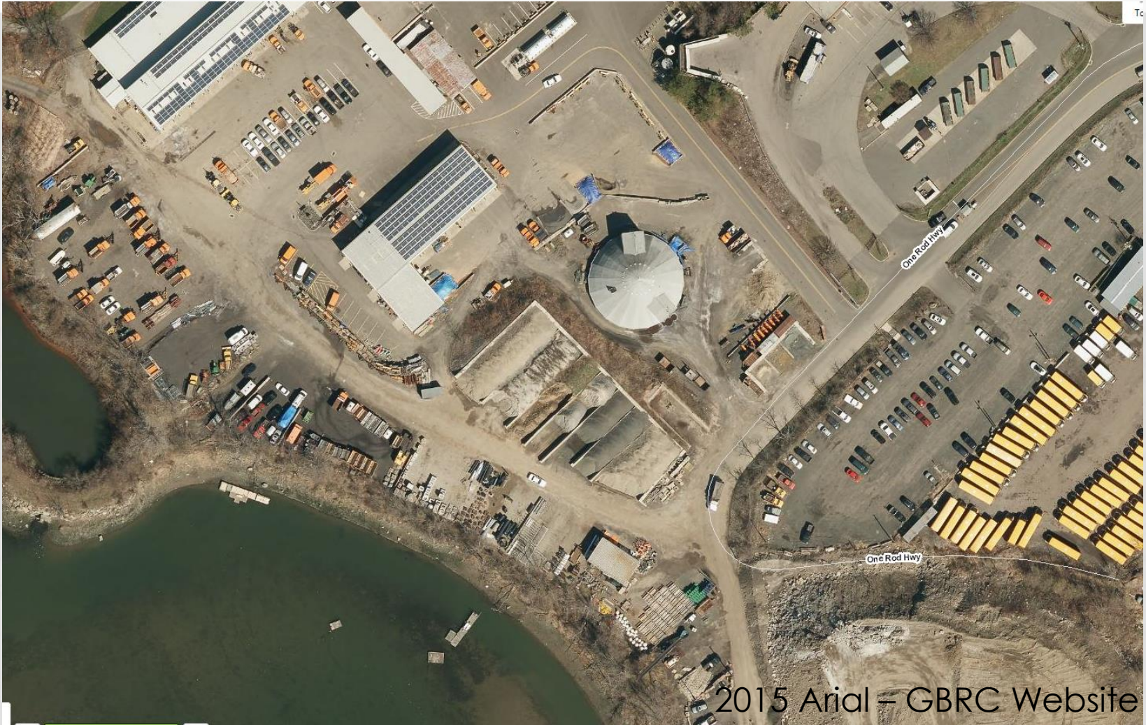
2015 Aerial - GBRC Website