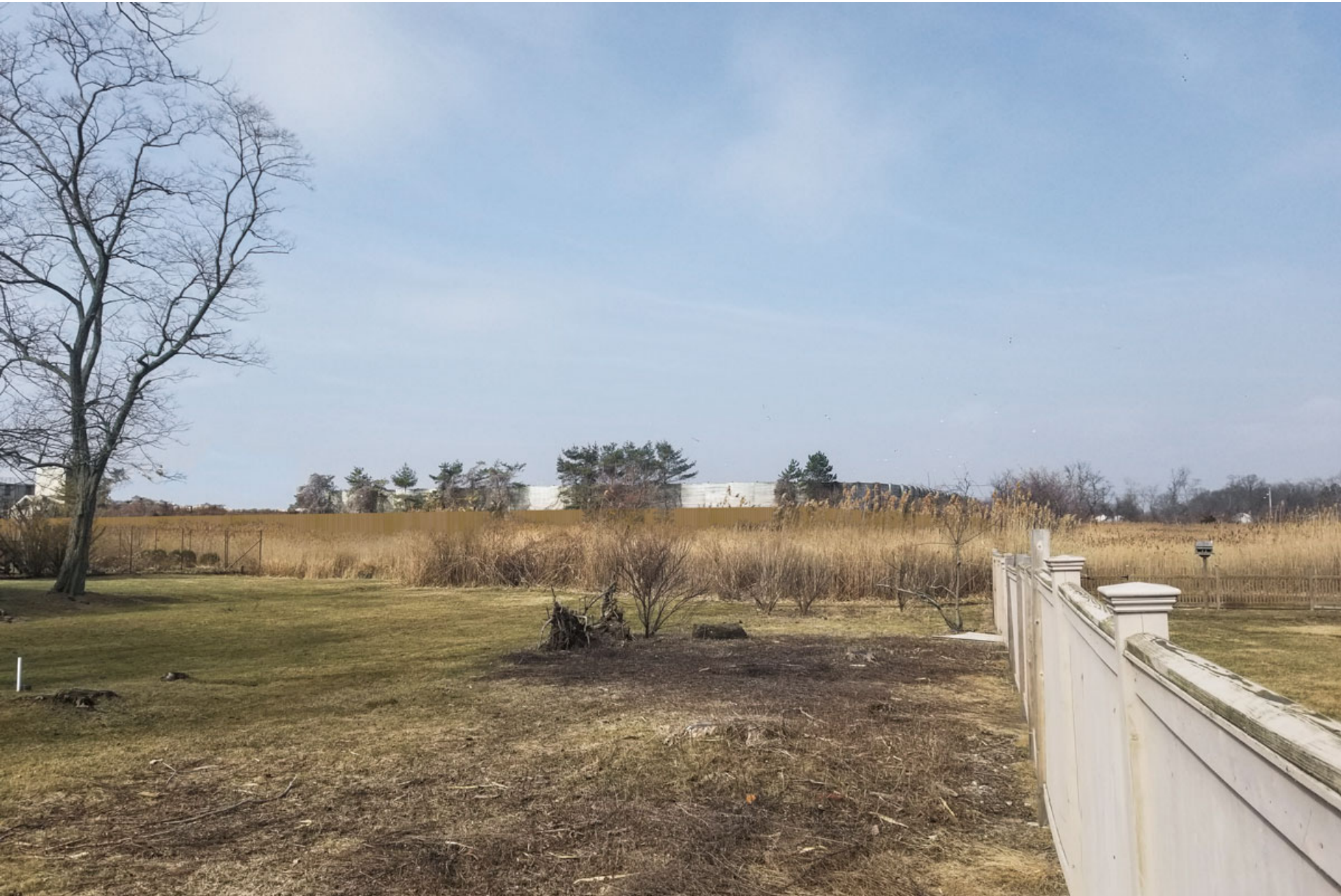
View from Fairfield Beach Road