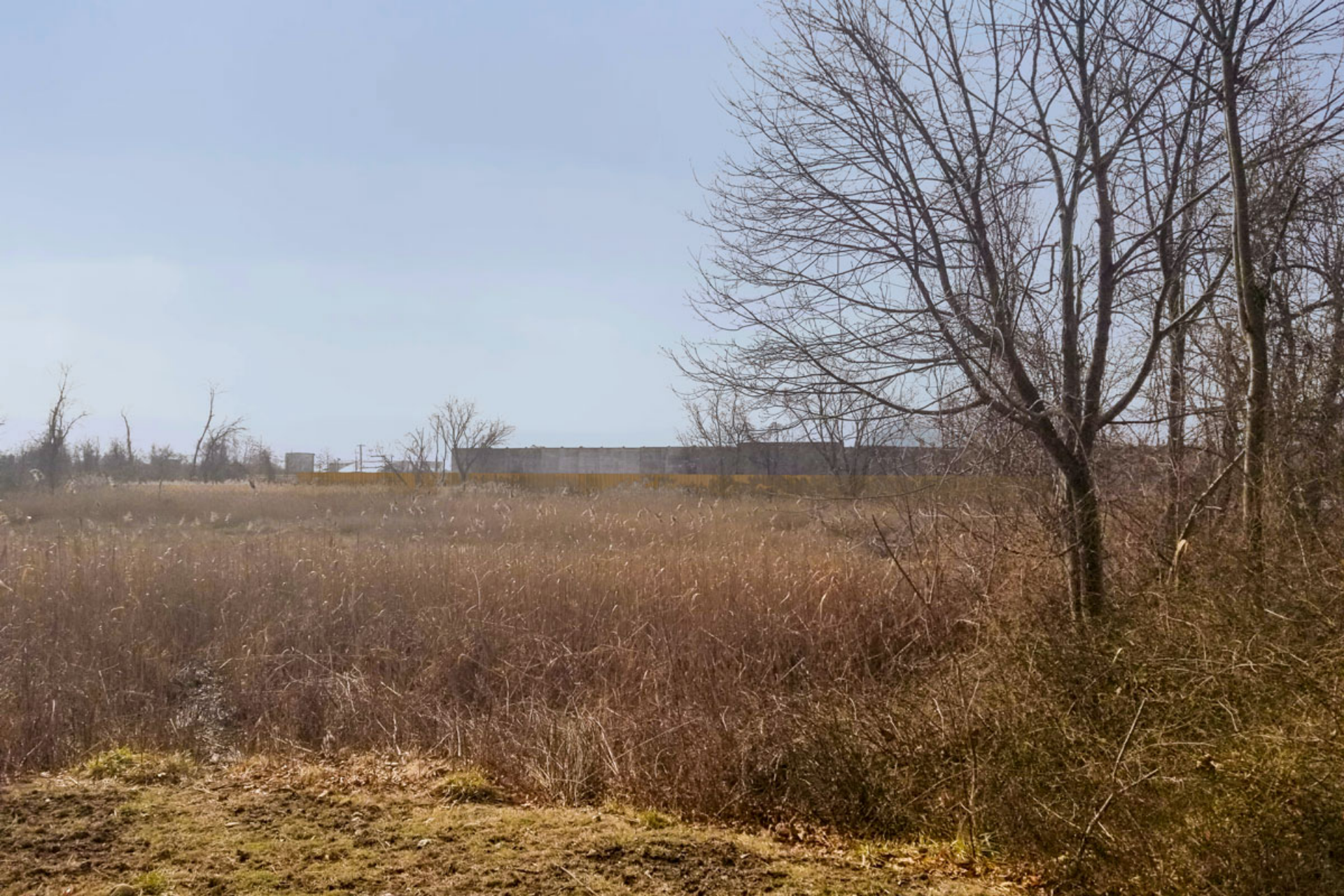
View from Forest Avenue