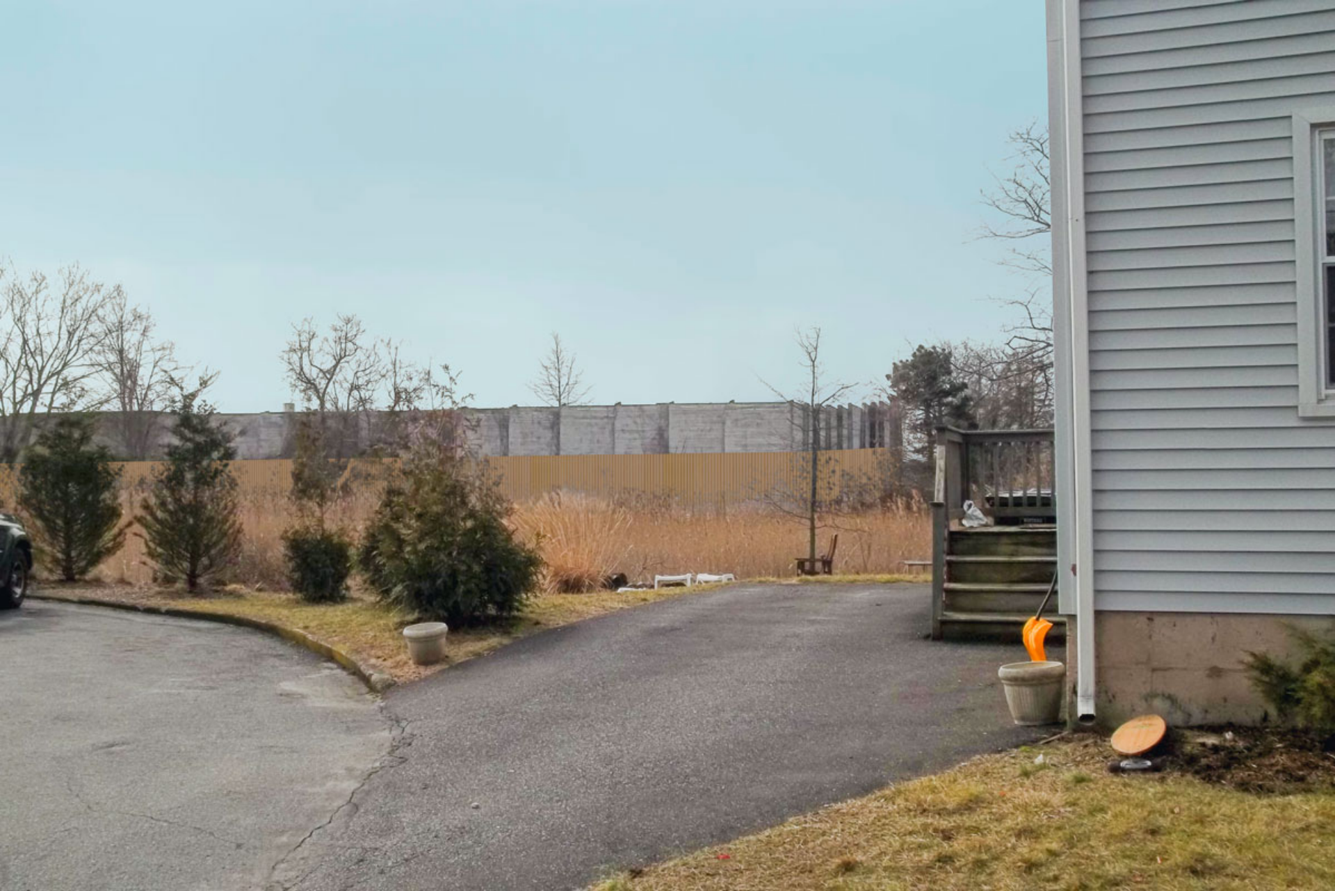
View from Longdean Road