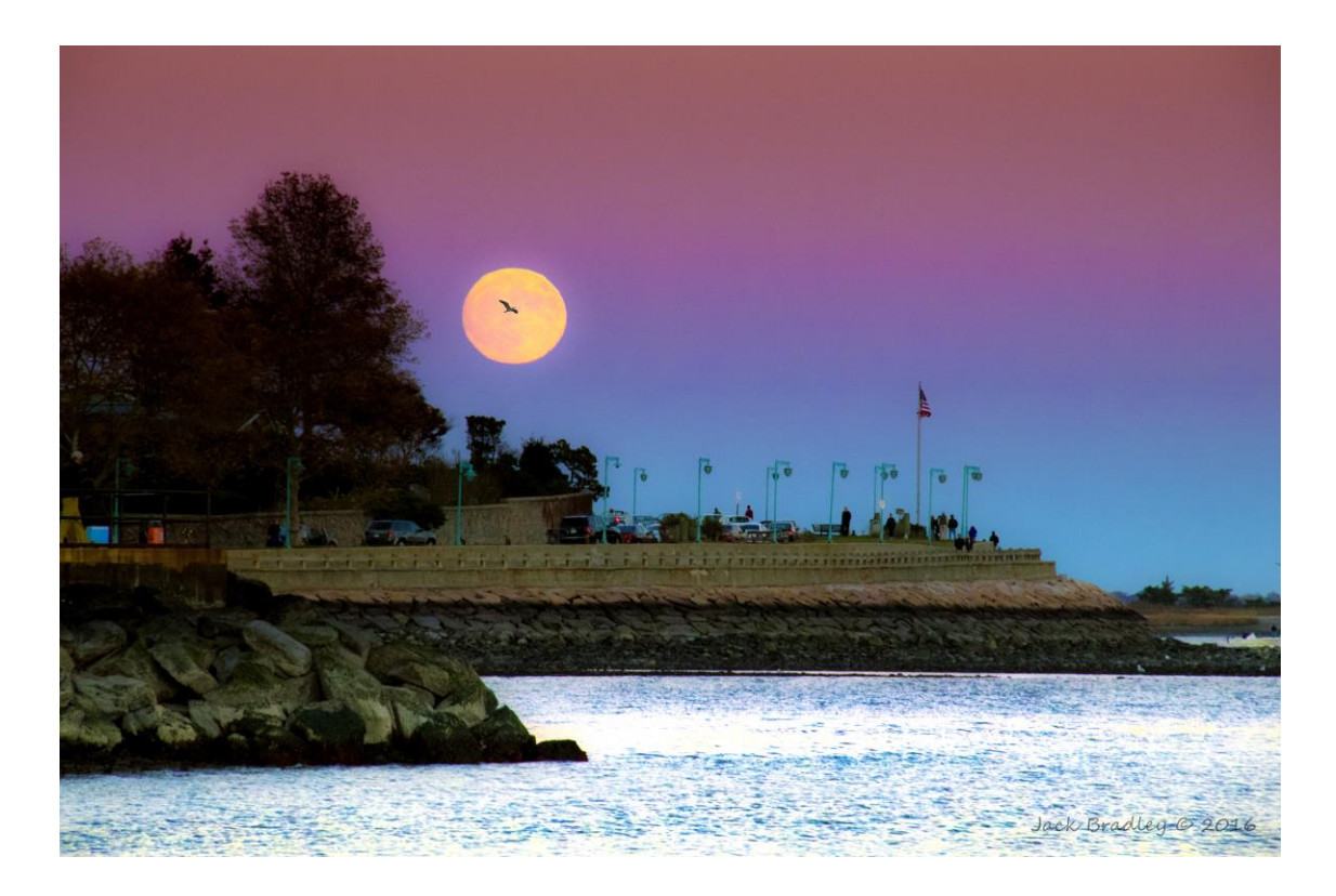
Fairfield Resident Enjoying a gorgeous view from Jennings Beach