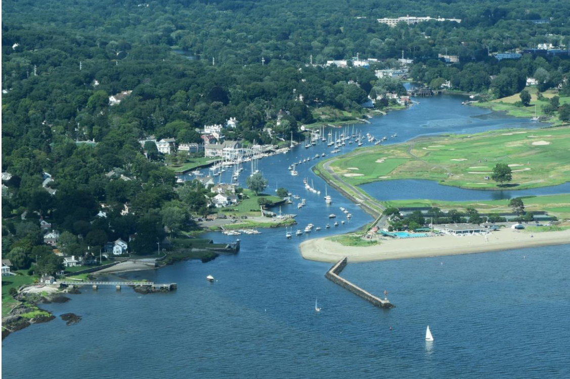
Aerial view of Southport Harbor