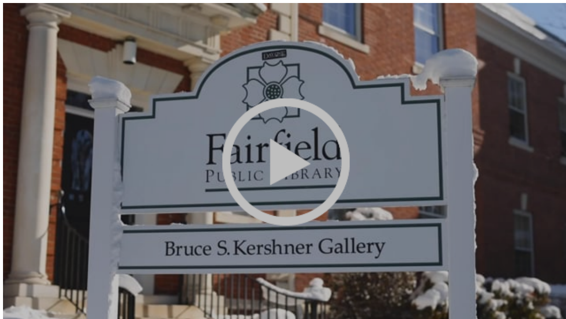
Fairfield Public Library and Community Video