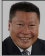
Senator Tony Hwang