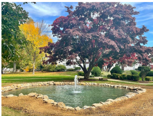
Burr Gardens Restoration