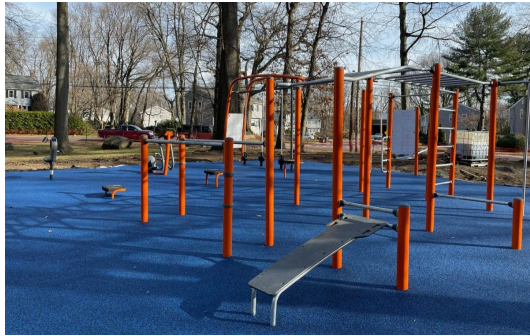
Gould Manor Park

the impact on Fairfield taxpayers. In 2022, Teri assisted Town departments in securing four discretionary grants totaling over $7 million.