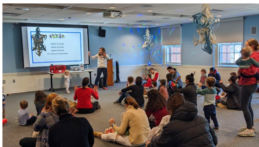
Winter Dance Party

This year's Summer Reading Challenge had 2,520 participants, with community members of all ages participating. The library also saw the return of regular art shows in the Bruce Kershner Gallery, First Friday Jazz, Storytime on the Green, and the full reopening of our Children's Room. I am proud to say all of this activity brought 274,424 visits to the library in 2022, 110% more than last year.