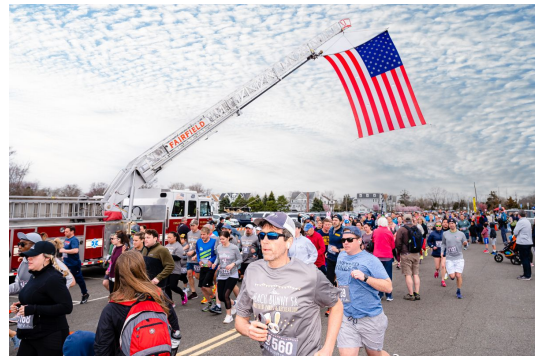
Beach Bunny 5k

The activities the Fairfield Public Library continues to provide are a great way to get children and their families active by immersing themselves in literature that is both fun and educational.