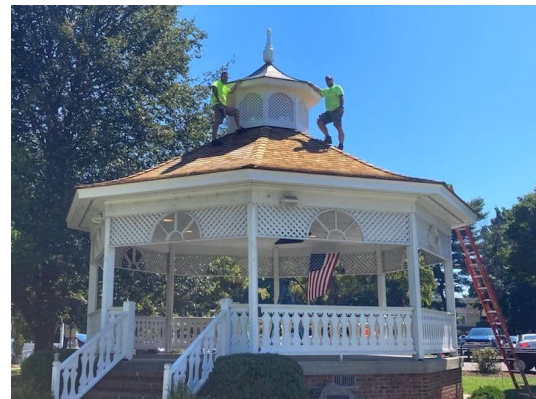
Sherman Gazebo Roof