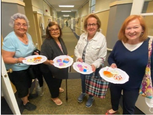
Cooking/Cookie Demo Class