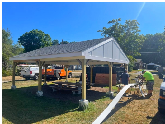
Dover Park Pavilion