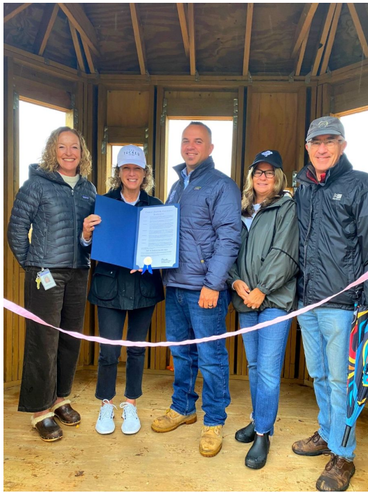
Bird Observation Blind