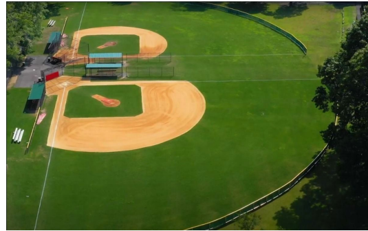
Ball Field at Gould Manor