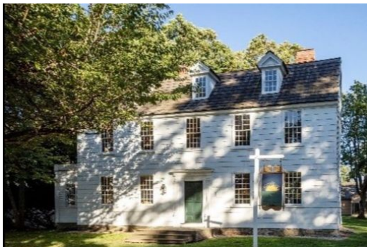
Fairfield Sun Tavern

The exhibitions are free with museum admission. Please click here for more information.