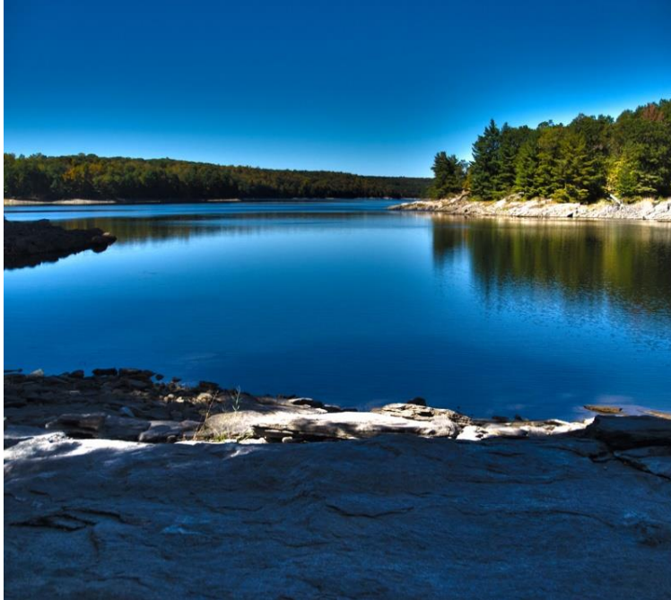
Aspetuck Reservoir – only minutes away from town