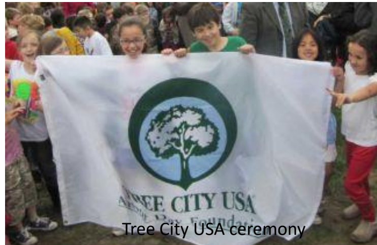
Tree City USA ceremony