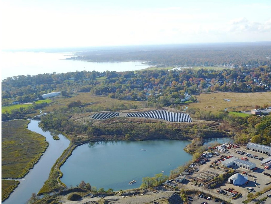
Solar array powering the Water Pollution Control Facility