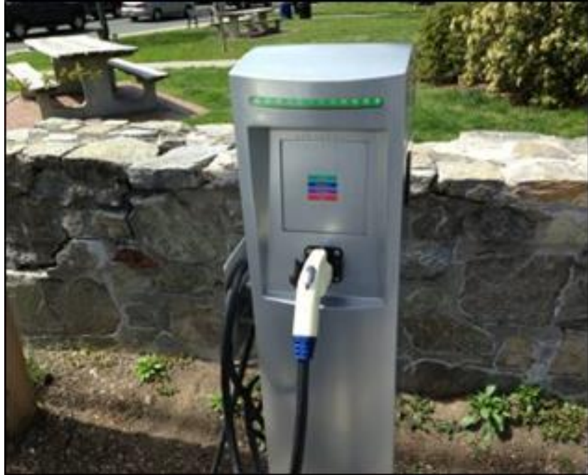
Level 2 EV charging station at Sherman Green installed in 2012