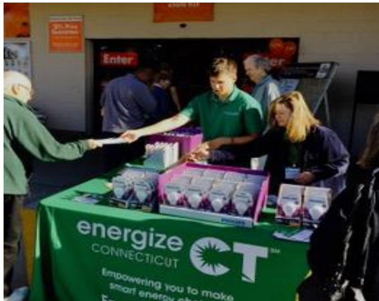
LED Light Bulb Exchange