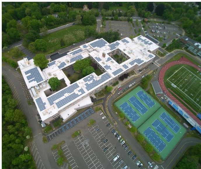
Reflective White Roof and Rooftop Solar Array at Fairfield Ludlowe High School