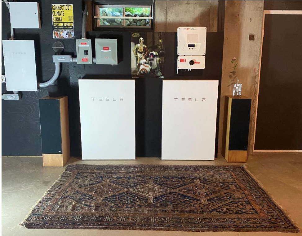
Tesla Powerwall residential backup batteries