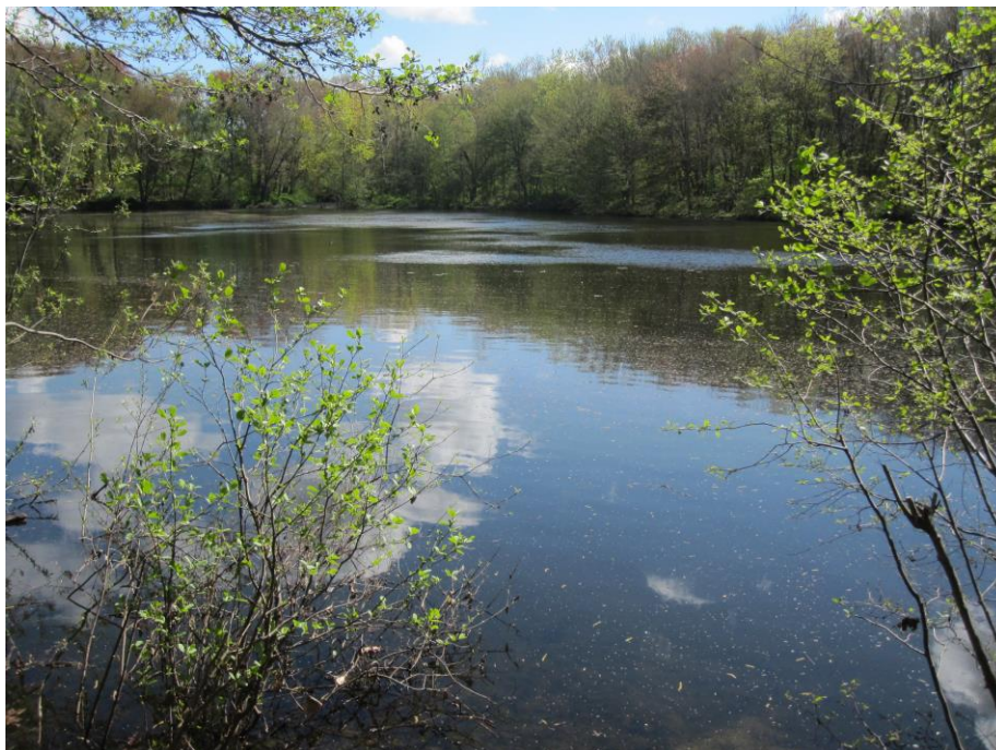
Perry's Mill Pond Open Space

The State of Connecticut's "Green Plan" established a goal to protect 673,210 acres (21%) of the state's land as open space by the year 2023. Ten percent of this open space is to be State parks, forests and wildlife areas. The other 11% is to be owned by Towns, private non-profit land conservation organizations, water companies, and the federal government.