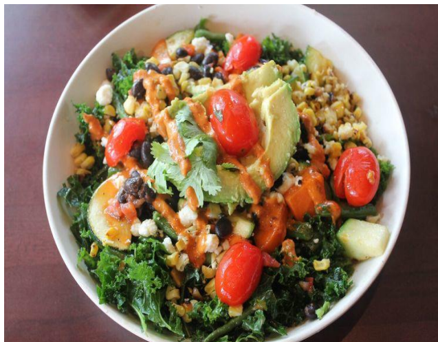
A healthy, locally-sourced meal at a Fairfield restaurant