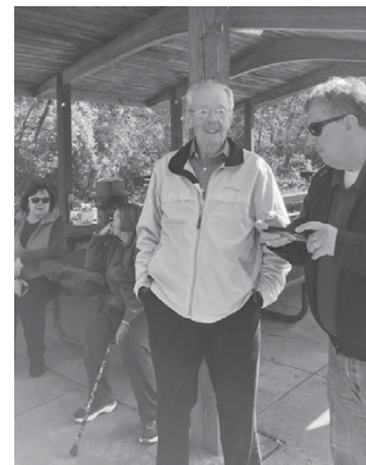
at Arbor Day, 2024.