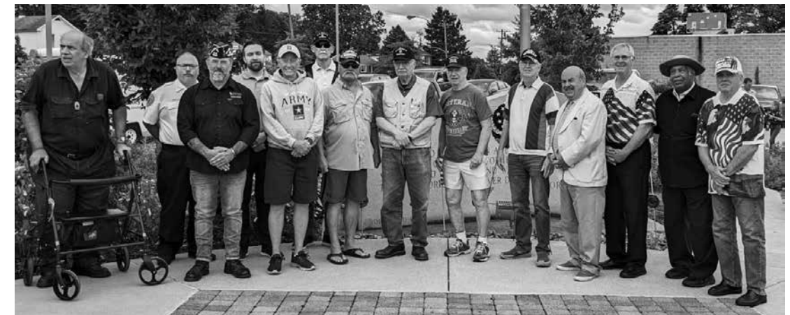
Veterans attending Memorial Day Remembrance

If you are looking for a way to give back to your community, come to a Rotary meeting and see what it’s about—they meet on Wednesday mornings at 7 a.m. at Jodi B’s Restaurant in the Forest Hills Plaza, Ardmore Boulevard. For more information: fhillslotary@gmail.com .