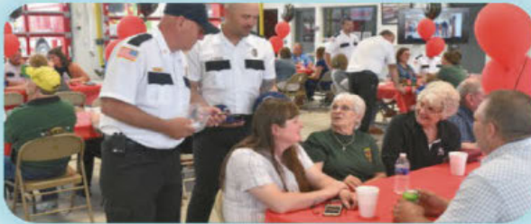
Friends gather to celebrate 50 years!