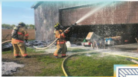
Shed Fire (May)