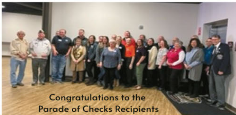
Congratulations to the Parade of Checks Recipients

Thank you to all who participated in the Village Rummage Sale and stopped down at the Lions Park barn for our brat fry on May 6 and 7. We look forward to our next event—frying fish for the Catfish Races and serving up some goods in the barn for the Catfish Concert on Friday, July 8 and Saturday, July 9. Hope to see you all there!