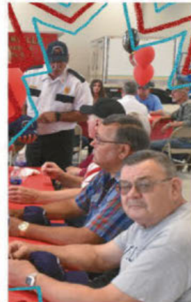
Retired Greenville Firefighters