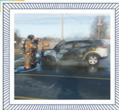
Vehicle Fire (March)