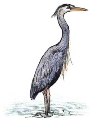
great blue heron

Mosquitoes have a very short life cycle and their eggs can remain dormant for more than four years, hatching when flooded with water. Therefore, even after a wetland has been drained, it may still hold enough water after a rain to breed mosquitoes.