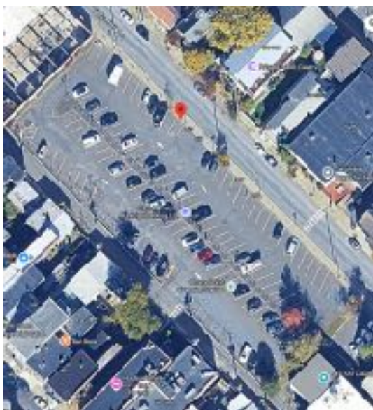
*Kiosk Placement - Municipal Lot at 525 Columbia St - Short Term Parking