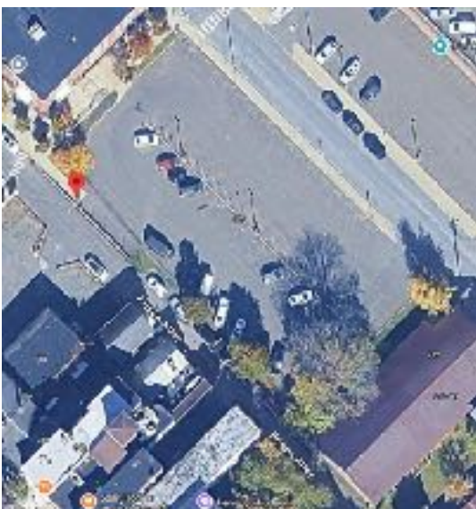
*Kiosk Placement -Municipal Lot at 327 Columbia St - Weekends Only 8am - 6pm no overnight parking