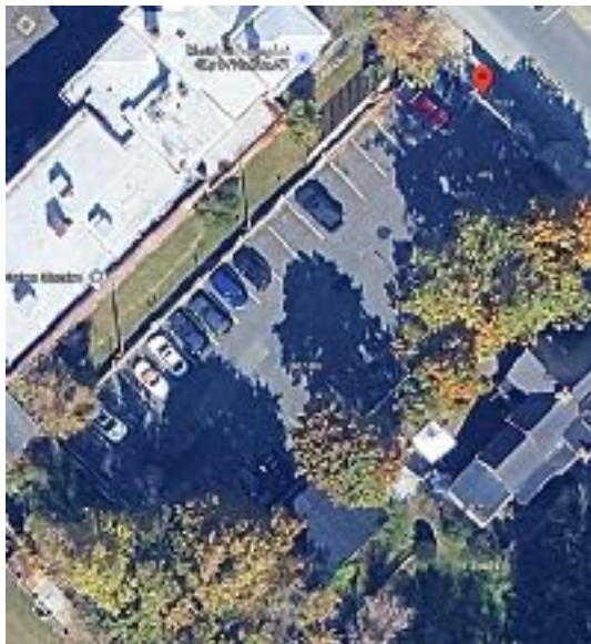
*Kiosk Placement - Municipal Lot at 607 Union St.- Short Term Parking.