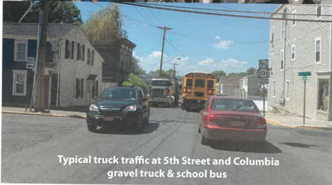
Typical truck traffic at 5th Street and Columbia gravel truck & school bus

For more information: Bottom Line / Linda Mussmann / 518.209-7966