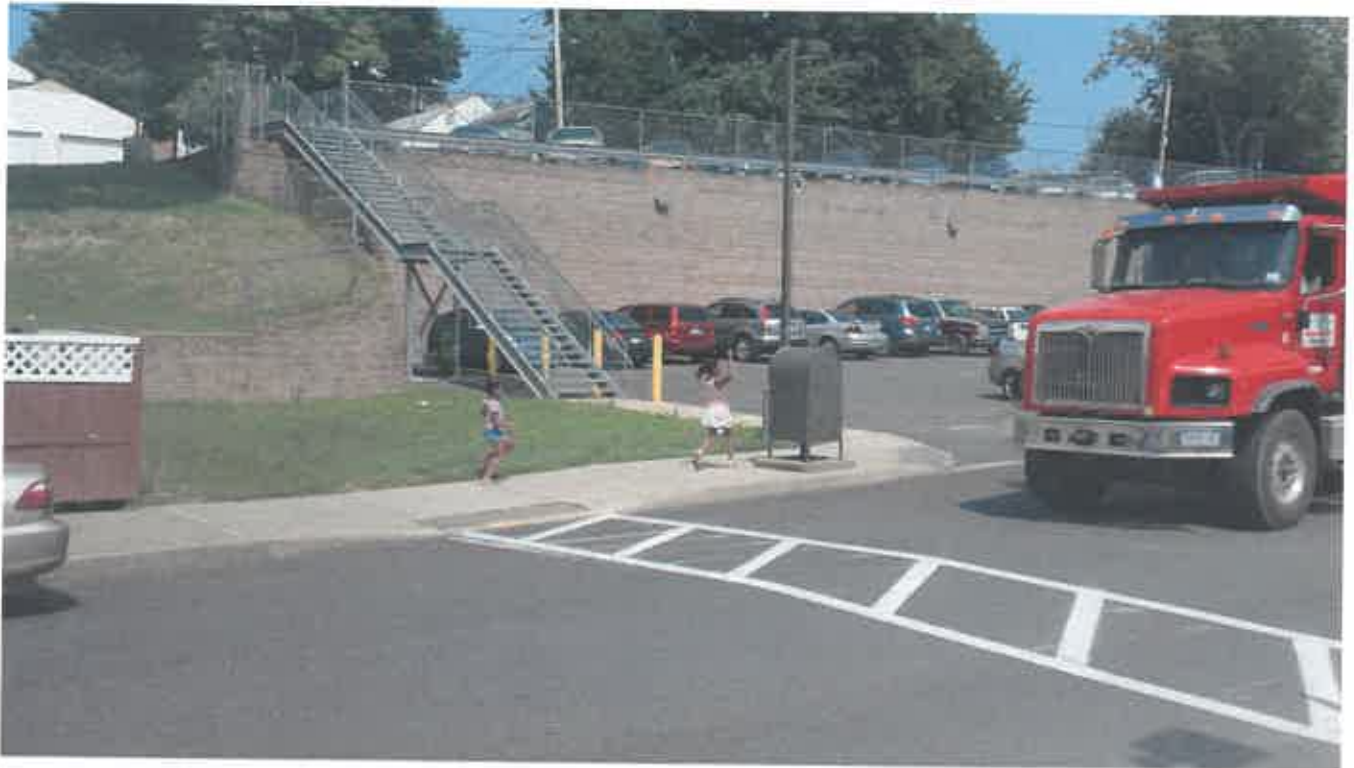
Mother with children walking pass Time & Space Limited.