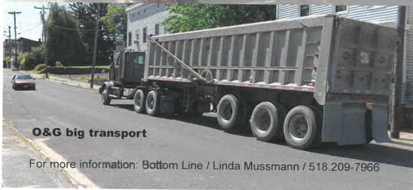
O&G big transport

For more information: Bottom Line / Linda Mussmann / 518.209-7966