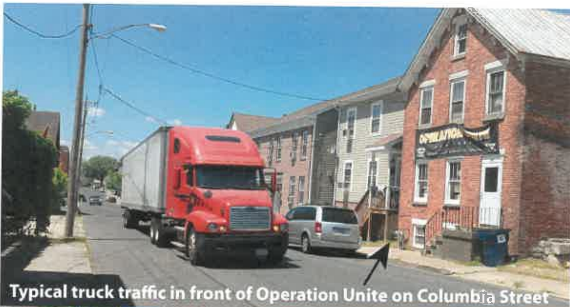
Typical truck traffic in front of Operation Unite on Columbia Street