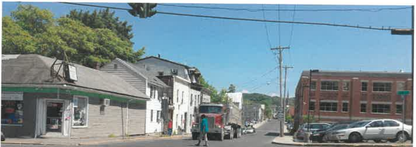
O&G gravel truck at Columbia Street and 3rd Street