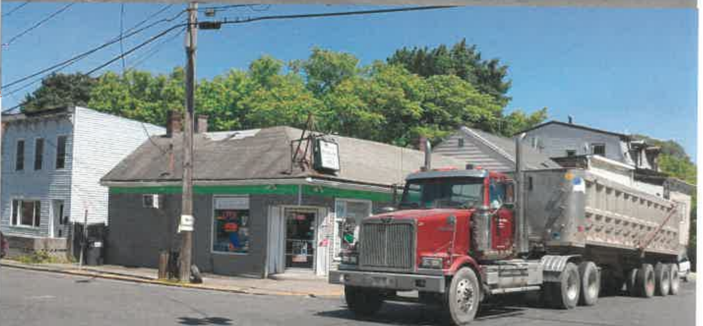
O&G gravel truck at Columbia Street and 3rd Street