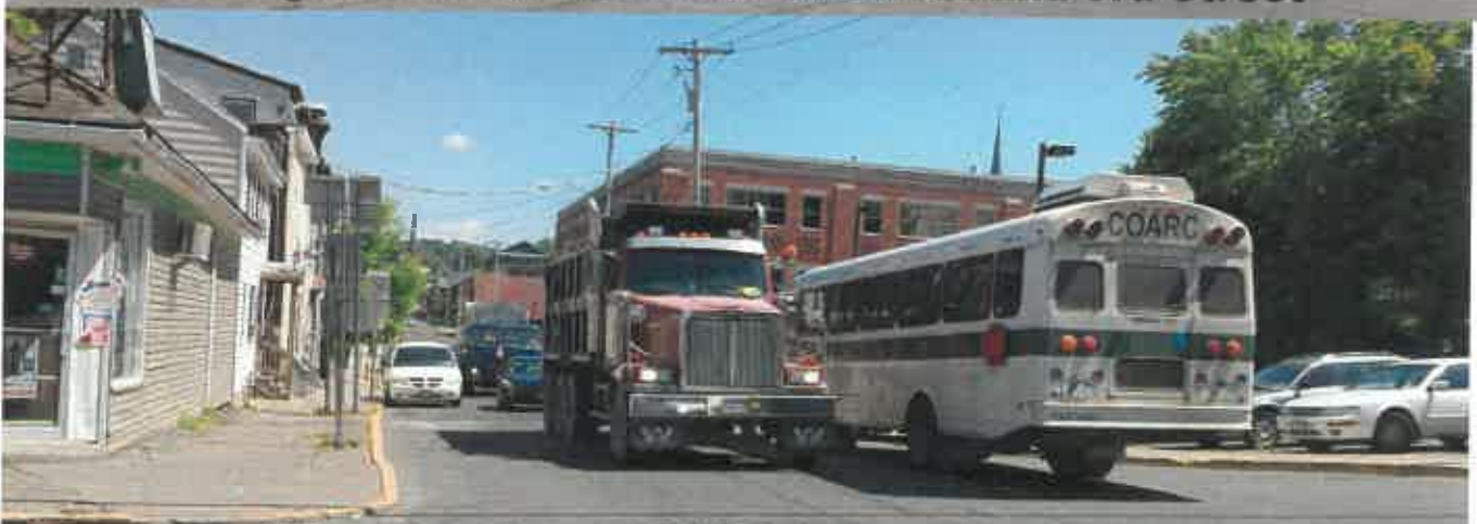
O&G gravel and COARC transportation bus at Columbia & 3rd Street