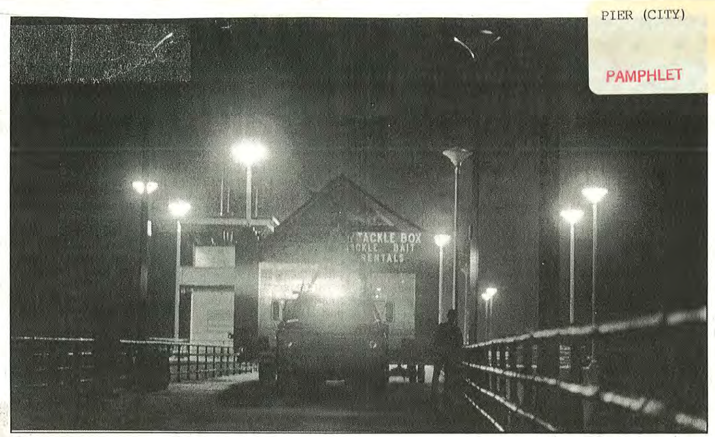
Movers prepare to move a bait and tackle shop from the 75-year-old Huntington Beach Pier, which will be demolished.