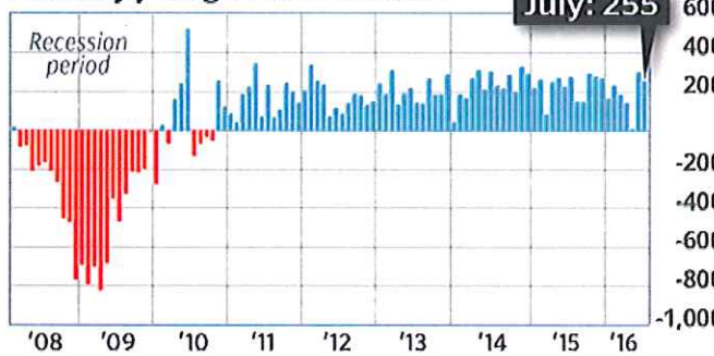
Monthly jobs growth In thousands