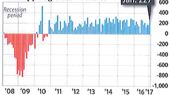
Monthly jobs growth In thousands