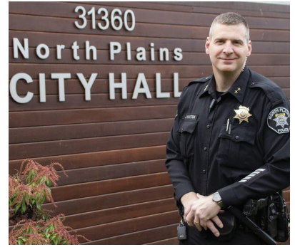
Chief James Haxton

In an additional effort to decrease unused medications available for misuse or accidental ingestion, Washington County Ordinance 848 requires drug manufacturers who sell their products in Washington County to provide a safe and convenient way for the public to dispose of unused medications. Contact your local pharmacy or visit medtakebackoregon.org to find a disposal location near you.