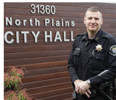
Chief James Haxton

Although we all appreciate warm and cozy cars on cold mornings, remember would-be-car thieves are always looking for an easy target. If you witness a crime in progress, call 9-1-1 immediately, or if you discover it after-the-fact, call non-emergency dispatch at 503-629-0111 to report it.