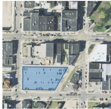
Emmet County data