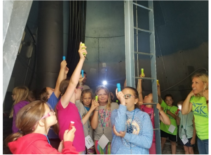
2018 participants inside the tower as part of the College for Kids program.