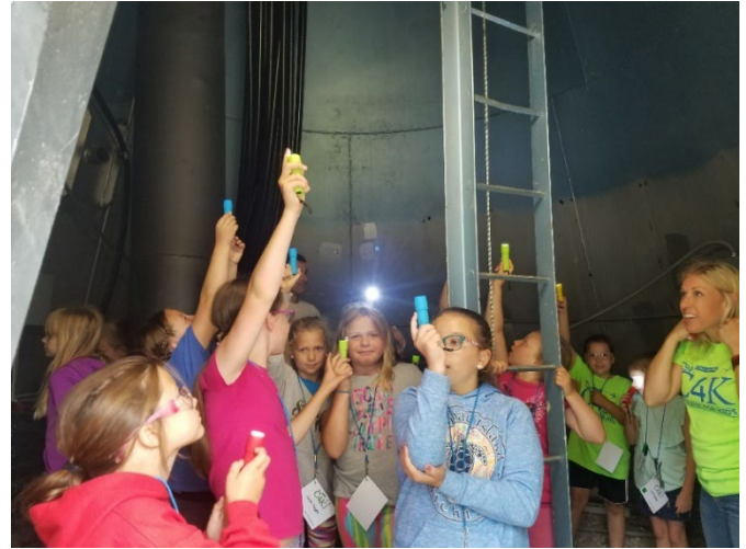
Participants inside the tower as part of the College for Kids program.