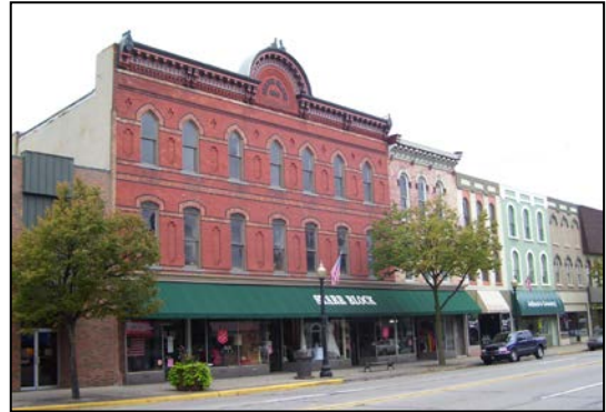
Downtown Coldwater is both a National Register district and local historic district

Boundary justification – District boundaries are based on several factors including historical significance of buildings, visual changes due to different architectural styles, building types, or periods, physical integrity of the buildings, and location of significant geographic features, i.e. rivers, highway, etc. If there is a National Register district and a local historic district in the same area, it is recommended that the boundaries be the same.