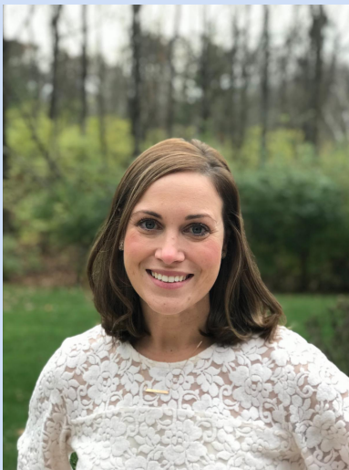
Mayor Jody Carney